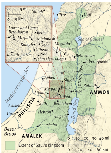
See Mizpah NW of Ramah, Samuel's hometown and Gibeah, Saul's hometown